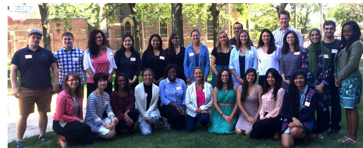
2015-2016 Illinois LEND Trainees

Priority is given to graduate students in the above disciplines and family/self-advocates; however, recent graduates working in the field may apply.